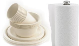
paper cups, plates & paper towels