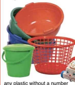
any plastic without a number