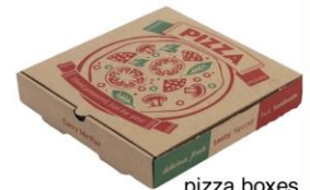
pizza boxes with food residue