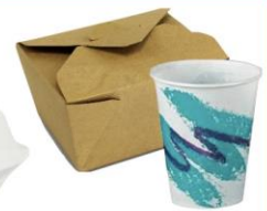
wax coated cups & food containers