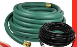
garden hoses, ropes & cords