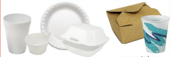
Styrofoam cups, plates & food containers