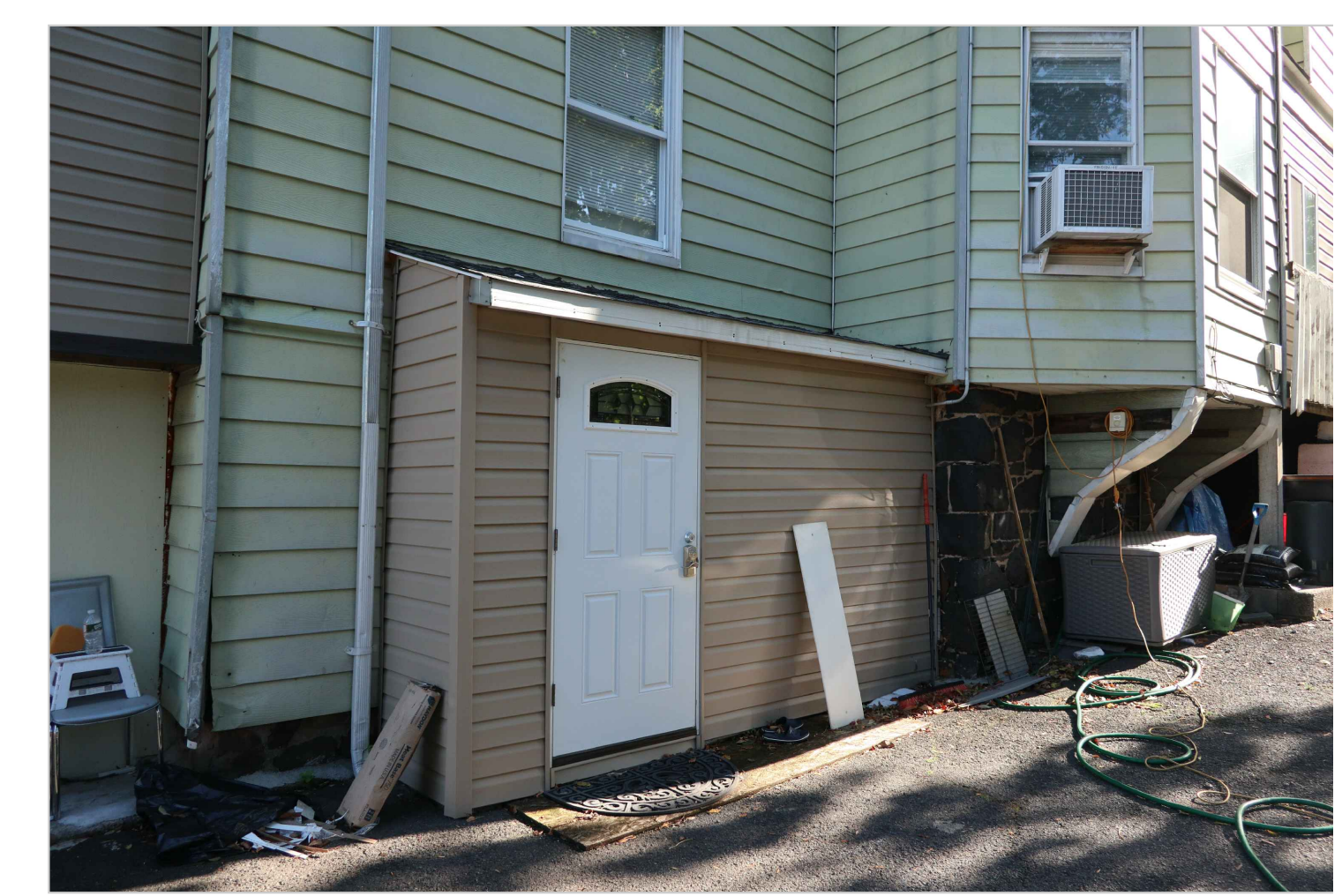
2 GRADE LEVEL ENTRANCE NTS