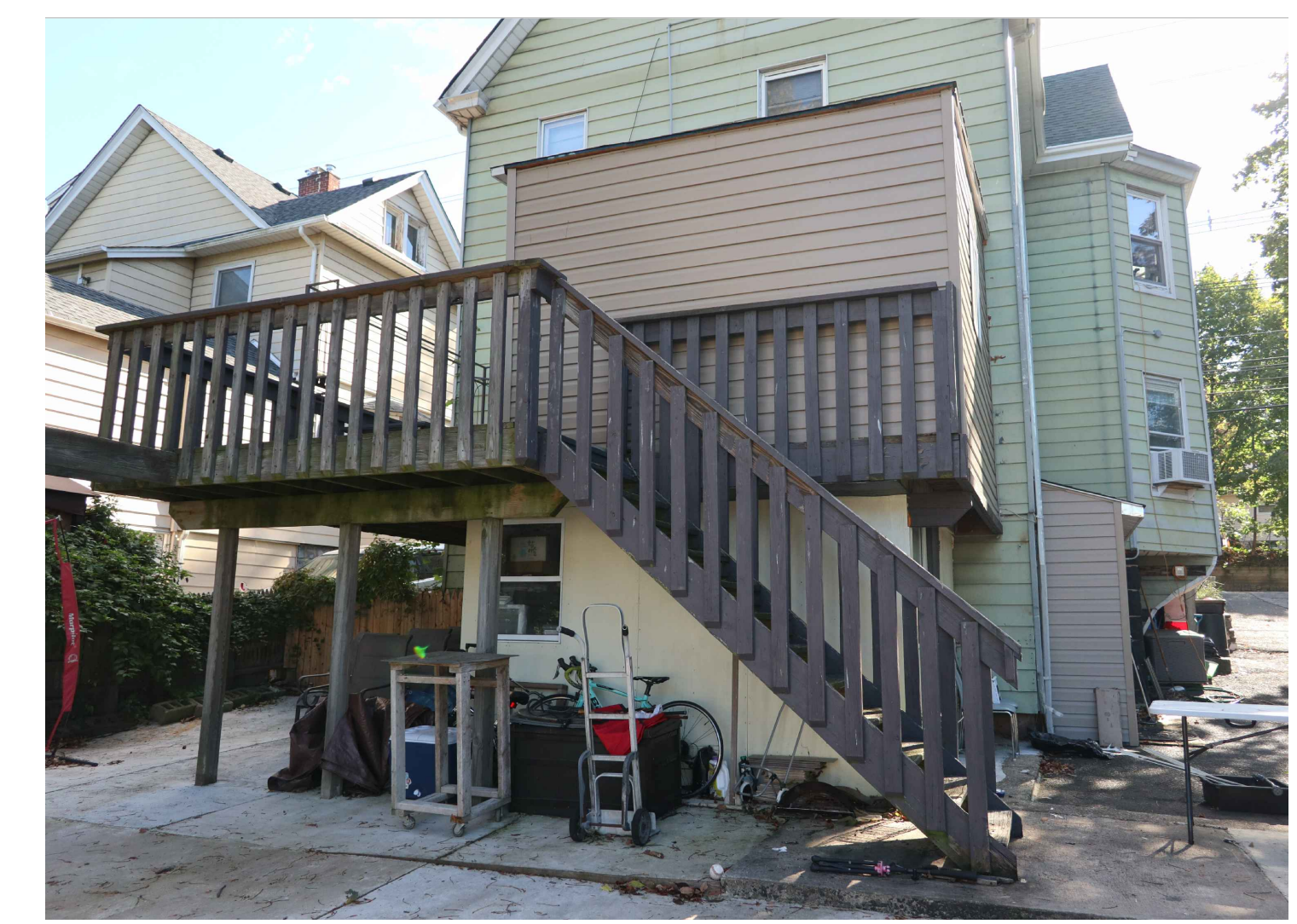
1 REAR YARD DECK/ EXISTING STRUCTURE NTS