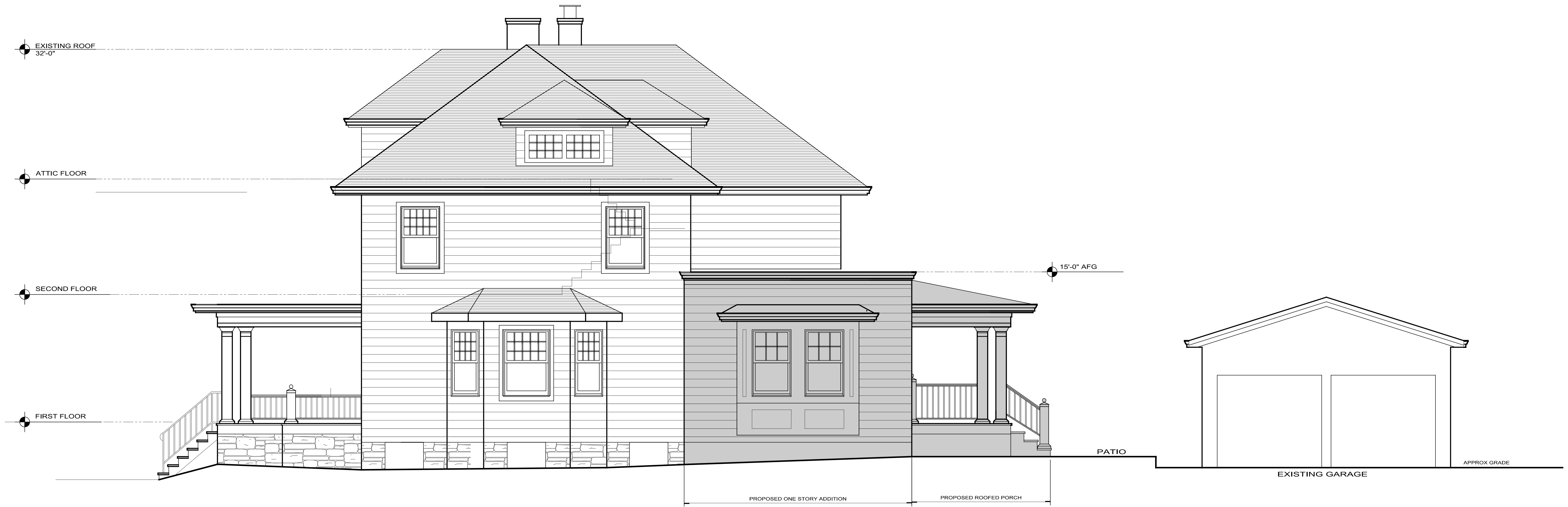
1 RIGHT ELEVATION (LEONIA AVENUE) 1/4" = 1'-0"