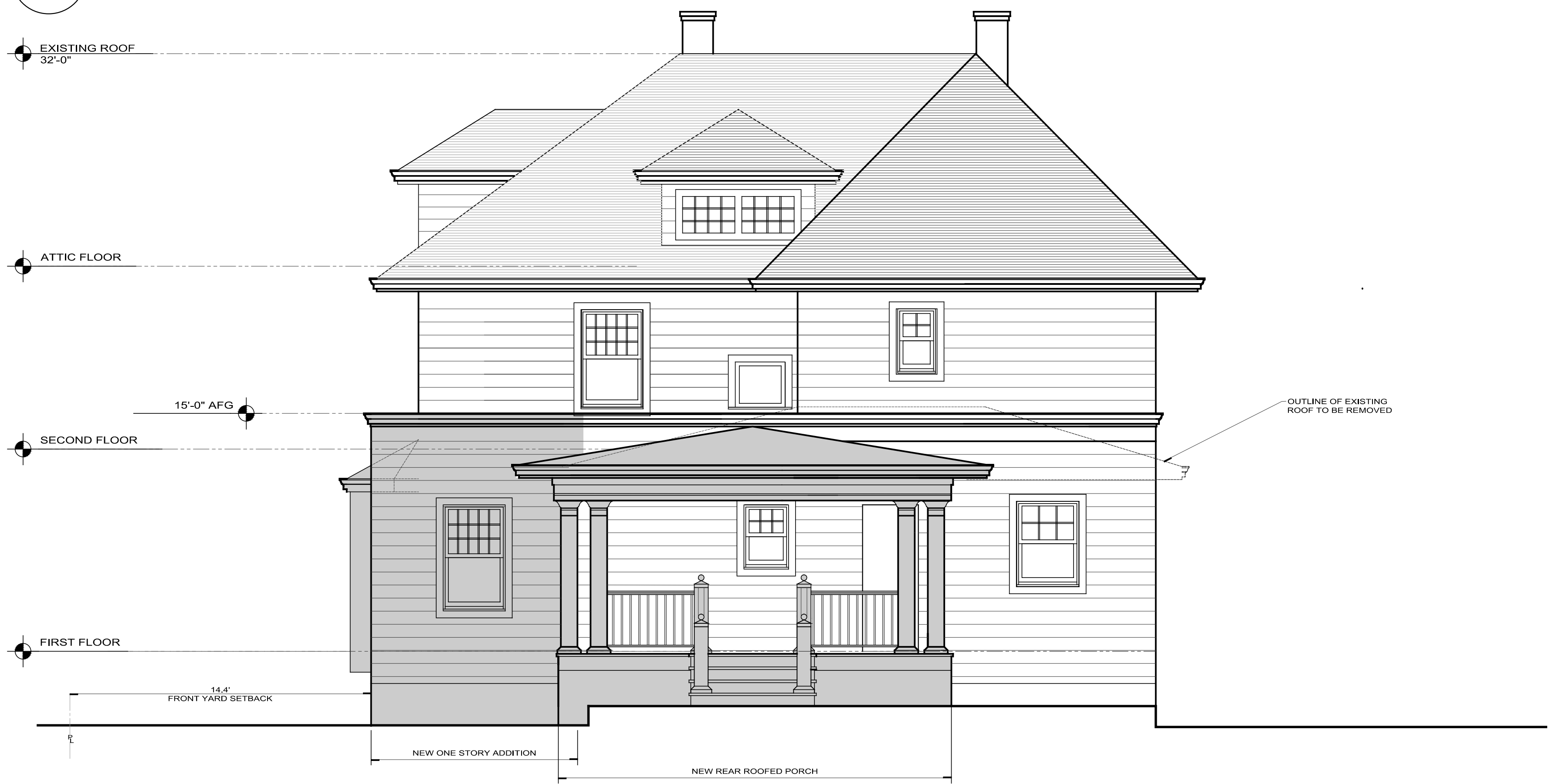
2 REAR ELEVATION 1/4" = 1'-0"

344 BROAD AVENUE LEONIA, NEW JERSEY 07605 TEL 201 461 5154 PULICE / WILLIAMS ARCHITECTS PROJECT: PROPOSED ADDITIONS MISTRY/ LEVI RESIDENCE 149 PROSPECT AVENUE LEONIA, NEW JERSEY 07605 DRAWING TITLE: PROPOSED EXTERIOR ELEVATIONS REVISION: DATE: 7/29/2024 ZONING PERMIT SCALE: AS NOTED SHEET NUMBER: D2 C8541 - NJ