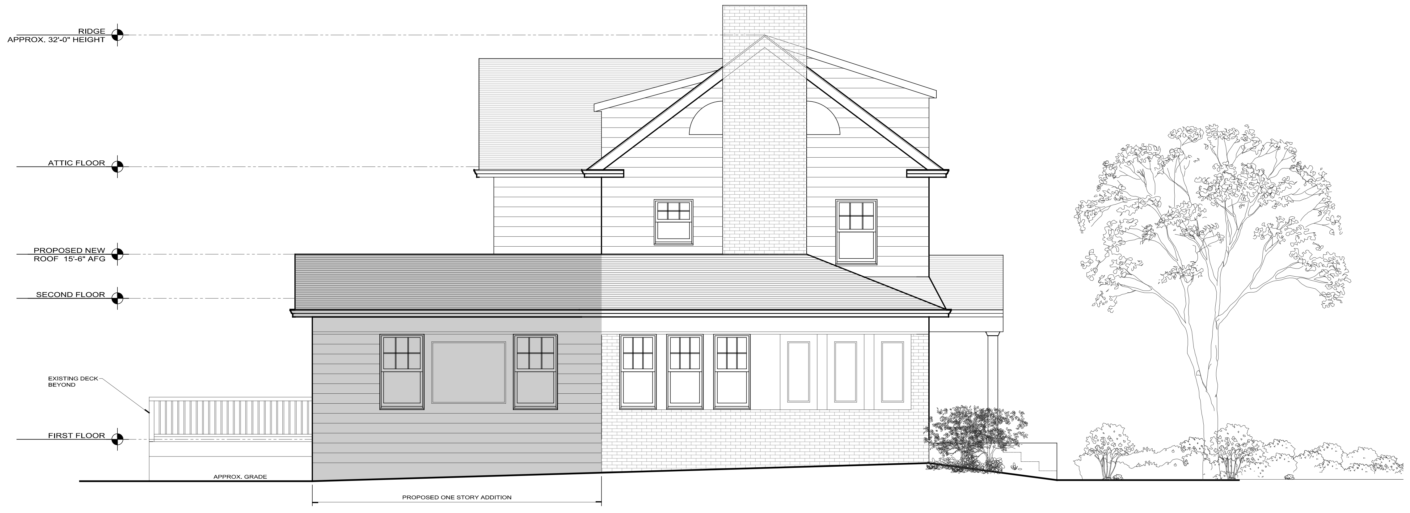
1 PROPOSED LEFT SIDE ELEVATION 1/4" = 1'-0"